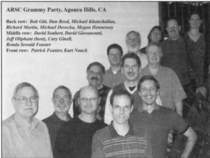
ARSC Grammy Party, Agoura Hills, CA