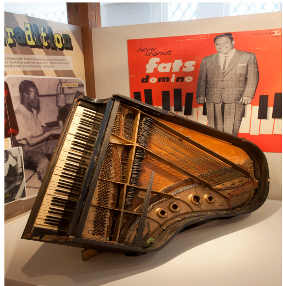
Fats Domino’s piano at the Unsung Heroes exhibit

On Thursday evening the Louisiana State Museum is hosting a private tour of the Cabildo (site of the Louisiana Purchase Transfer ceremonies in 1803) and the exhibit