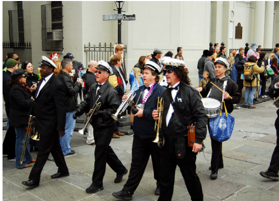
A jazz band leads the Krewe of Barkus through Jackson Square

Get set to head to New Orleans on May 19–22, 2010 for the 44th annual ARSC Conference. Our local hosts include three of the city's most august museums and research centers -- The Historic New Orleans Collection, the Louisiana State Museum, and Tulane University's Hogan Jazz Archive -- all of whom will be offering free tours during the conference.