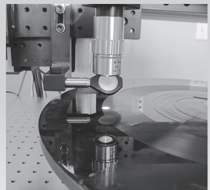
IRENE's 2D camera images the grooves on a lacquer disc.

The IRENE technology was developed by the Lawrence Berkeley National Laboratory in collaboration with the Library of Congress.