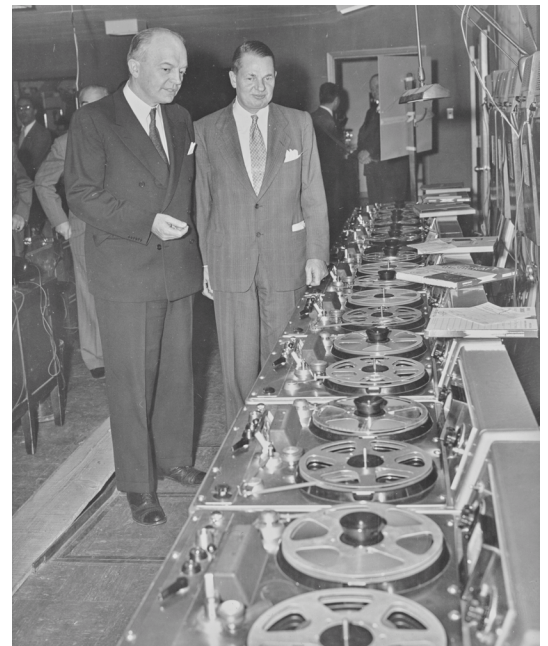
Ampex executives review tape machines.

Names and addresses of new ARSC members are not available in the on-line version of the newsletter.