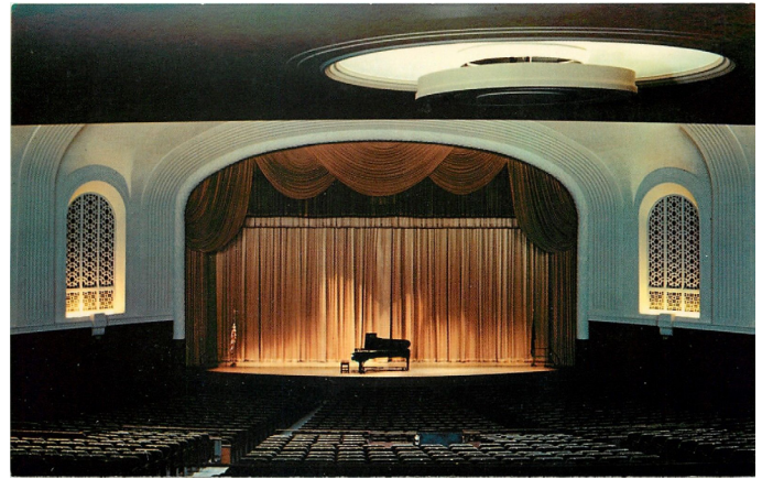
Indiana University Auditorium Interior, Bloomington Indiana c.1950s. Postcard published by Indiana University Bookstore

http://arsc-audio.org/conference/register/