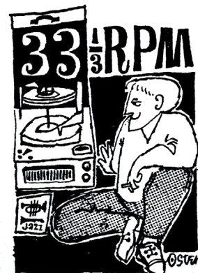
Illustrations by Osten, Music Mirror 1956